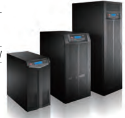
High power performance HPH series UPS