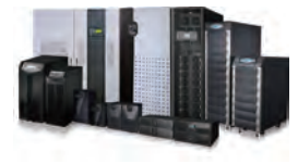
Delta offers a full range of UPS solutions from 600 VA to 4000 kVA to fulfill your power security needs.

HPH-B: UPS integrated battery model has batteries inside HPH-BN: UPS integrated battery model has no batteries inside