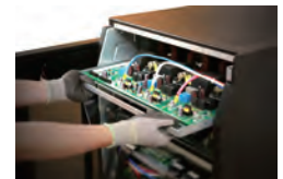
Swappable interior architecture for quick and easy maintenance*