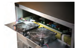
Redundant fan design enhances system reliability*