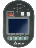
Control and LCD Display Panel

All specifications are subject to change without prior notice.