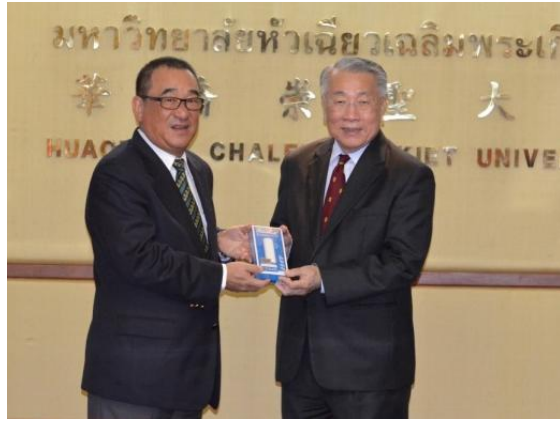
Presidents of Delta and Huachiew University exchanged souvenirs