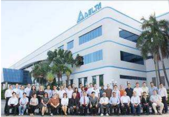
The second year of LTD training project at Bangpoo Industrial Estate Thailand in November 2010

resources for business expansion in various regions around the globe. This project consists of 4 continuous training courses by rotating site visit among branches and subsidiaries in four countries. The 2010 was the second year of this program and it is organized at the office of subsidiaries in Slovakia, China, India and Thailand with more focus on customer services. This project had totaled 27 participants who entirely completed the training and earned certificates. This LTD project is planned to be conducted every year.