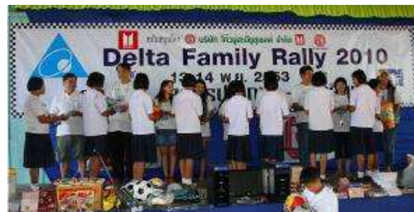
Delta Family Rally 2010 on 13-14 November arranged to raise fund to buy education equipment for students at Ban Nong Katoom School

“Delta Family Rally 2010 from Samut Prakan to Prachin Buri” is another activity raising fund to buy computer and study equipment for students at Ban Nong Katoom School in Prachin Buri.