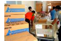
Delta donated money and things to help flood victims through Phraksa Municipal Office, Samutprakarn Province and TV3 news family