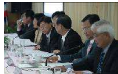
2010 Annual General Meeting, April 5, 2010

Minutes of meeting recorded in writing every resolution, showing the number of approval, objection and abstention votes for each agenda. Questions, response, and opinions arose during the meeting were fully documented in order to examine afterwards. Report of