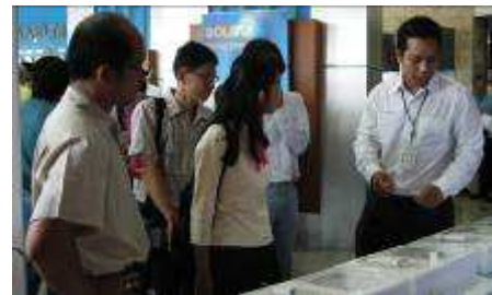
Shareholders paid visit Wellgrow Industrial Estate, Chachoengsao