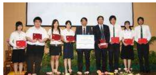
Scholarship awarded to the students of Kasetsart University