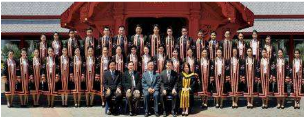
The 38 employees who graduated under educational support program with joint cooperation with Rajabhat Thonburi

The Company gives importance on educational support as part of human resource development. A joint cooperation program with Rajabhat University is specially established for potential employees to extend study on Business Administration. This educational support also extends in form of annual scholarships to employees and their children who have outstanding academic performance.