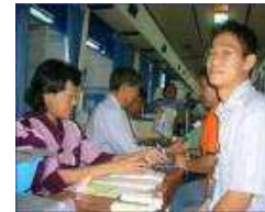
Employees participating in blood donation every 3 months