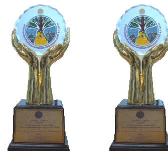
"Labour Relations and Welfare Award" year 2010

The Company continuously gives precedence to promote labour relations among employees and managements as well as provides proper welfare to all employees. This has been acknowledged by receiving " Labour Relations and Welfare Award " from the Department of Labour Protection and Welfare, the Ministry of Labour, for 5 consecutive years. In 2010, Company received rewards for both plants at Bangpoo and Wellglow Industrial Estate.